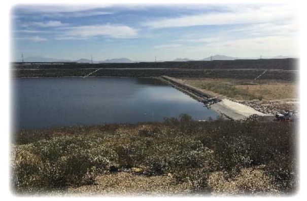
San Sevaine 5 Basin

Monitoring Activities. During this reporting period, the IEUA performed its ongoing monitoring program to measure and record recharge volumes and to collect stormwater quality samples pursuant to its permit requirements. Also, during this reporting period, approximately 84 recharge basin and lysimeter samples were collected for water quality analysis, and 28 recycled water samples were collected for alternative water quality monitoring plans, including the application of a correction factor for soil-aquifer treatment, determined from each recharge basin's startup period. Monitoring wells located downgradient of the recharge basins were sampled, at a minimum, on a quarterly basis; that said, some monitoring wells were sampled more frequently during the reporting period for a total of 126 samples.