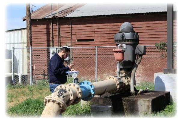
Reading a Meter on an Agricultural Well

Watermaster collects grab water quality samples at two sites along the Santa Ana River (Santa Ana River at River Road and Santa Ana River at Etiwanda) on a quarterly basis. Along with data collected at four wells near the Santa Ana River, these data are used to characterize the interaction between the Santa Ana River and nearby groundwater. During this reporting period, Watermaster collected four surface-water quality samples.