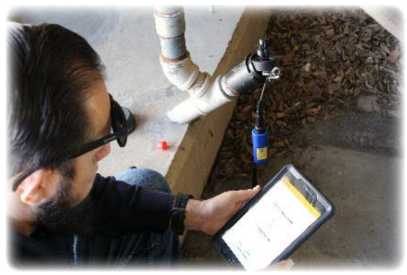
Setting a Transducer to Record Water Level Data

The current groundwater-level monitoring program is comprised of about 1,100 wells. At about 900 of these wells, water levels are measured by well owners, which include municipal water agencies, the California Department of Toxic Substances Control (DTSC), the Counties, and various private consulting firms. Watermaster collects these water level data at least semi-annually. At the remaining 200 wells, water levels are measured by Watermaster staff using manual methods once per month or by using pressure transducers that record data once every 15 minutes. These wells are mainly Agricultural Pool wells or dedicated monitoring wells located south of the 60 freeway.