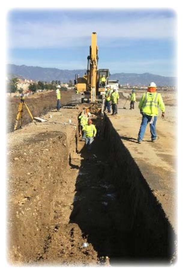
Trenching for a Pipeline at San Sevaine Basin

Recharge Activities. During this reporting period, ongoing recycled water recharge occurred in the Brooks, 7th Street, 8th Street, Turner, Ely, RP-3, Declez, Victoria, Hickory, and Banana Basins; stormwater was recharged at 18 recharge basins across all management zones of the Chino Basin; and imported water was recharged in 17 recharge basins, primarily in MZ-1. Watermaster and the IEUA recharged a total of 15,378 acre-feet of water: 4,043 acre-feet of stormwater, 5,689 acre-feet of recycled water, and 5,646 acre-feet of imported water.